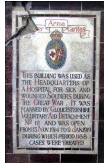
Mitton Farm Plaque, 2016