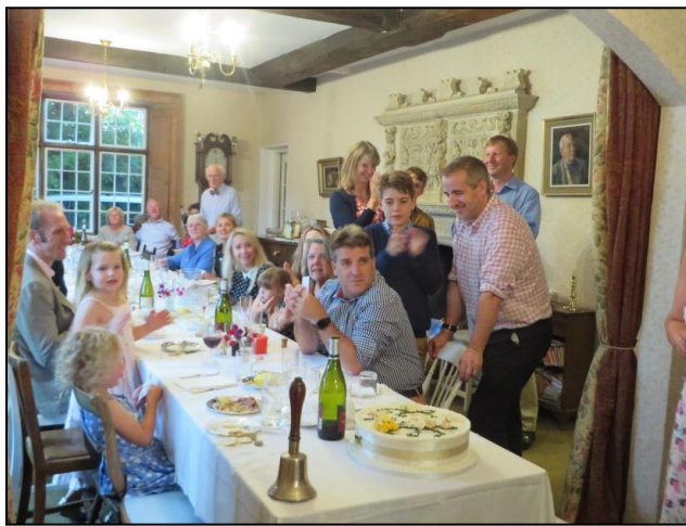
The Celebration of a recent Golden Wedding, reminding us of the sheer numbers of men and women who had lived in the house during WWI