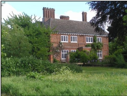
Mitton Manor House 2011

All such hospitals were awarded a plaque as appreciation for their work – but that from Mitton Manor was missing – until recently!