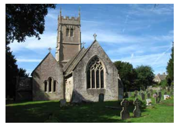
St Matthew's church Coates (CCL)