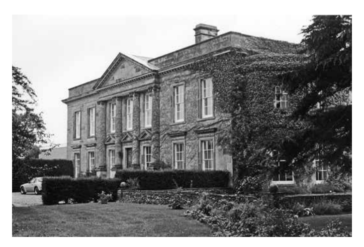
Coates manor house after the rebuilding in 1919-21. The house is now known as Bledisloe Lodge

the hamlet of Tarlton, which was divided between Coates and Rodmarton until the late 19th century. The profusion of estates all labelled with the same name in Domesday Book proved a challenge, and has led many previous historians to misidentify which of the estates in Tarlton descended with the manor of Hullasey to become part of the parish of Coates. In this matter we are indebted to our predecessors for