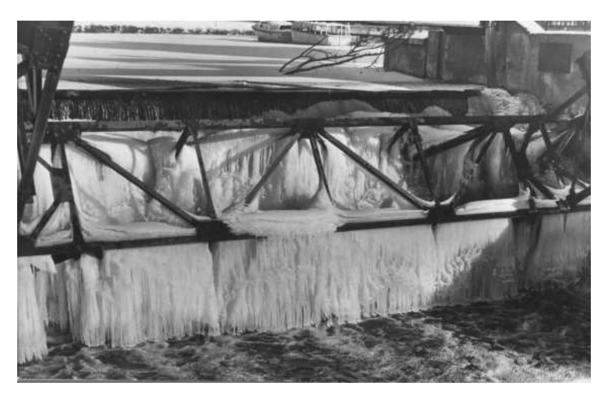
Figure 1 Abbey Mill Sluice Gate 193