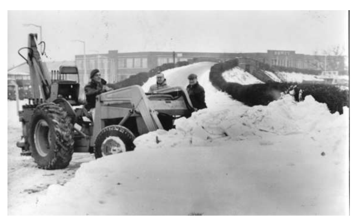
Figure 4 Snowed up at Ashchurch 1963