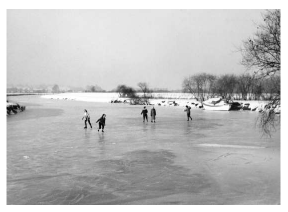
Figure 3near Bredon Skating on the Avon