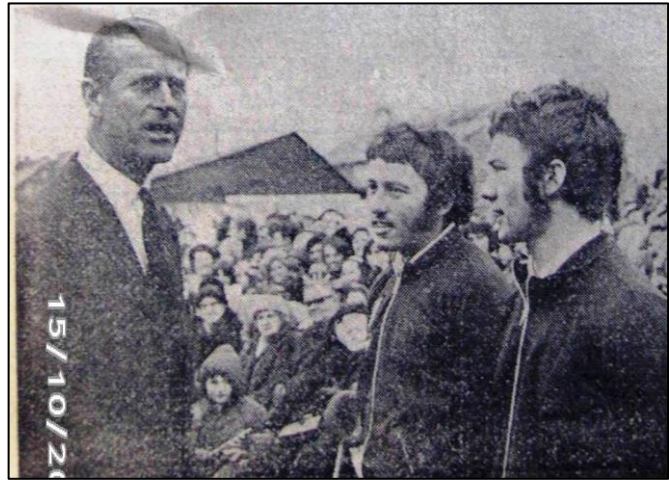
The photograph spoils his hair! With the lads at Cascades