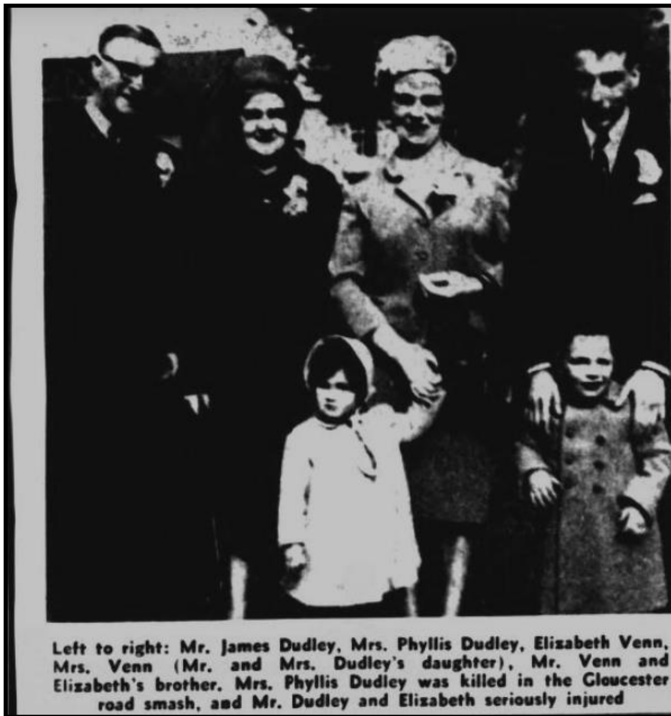
Newspaper Photograph of the Family

The van was propelled so far forward by the impact of the lorry from the rear that it wedged under no. 170 bus at the junction driving north from Gloucester. The van passengers were extricated by Tewkesbury Fire-Brigade [helped by Cheltenham]. Several passengers on the bus suffered from shock – a dog in the van “ escaped unhurt ”.