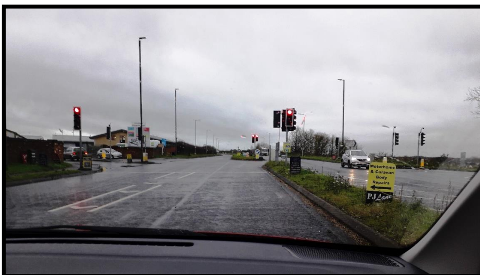
The same junction for a right turn on a wet day in December 2020 – now with traffic light

The only positive legacy is that, perhaps in the 1980s, these traffic lights were installed which are now controlled intelligently. It is worth being patient.