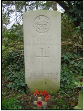
Tewkesbury Cemetery Grave C-474

Commemorated in Tewkesbury at the Cross and in the Abbey