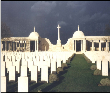
Loos Memorial, France

Commemorated in Tewkesbury at the Cross and in the Abbey