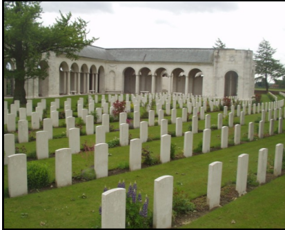
Le Touret Memorial, France

Commemorated in Tewkesbury at the Cross and in the Abbey