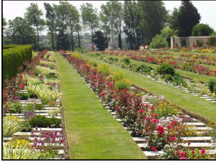
Boulogne Eastern Cemetery, France

Commemorated in Tewkesbury at the Cross, in the Abbey and on the County Memorial