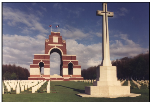
Thiepval Memorial, France

Commemorated in Tewkesbury at the Cross and in the Abbey