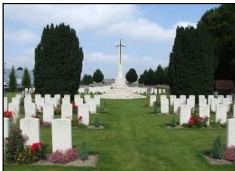
Harlebeke New British Cemetery

Commemorated in Tewkesbury on the Grammar School Memorial