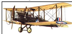
De Havilland 4 Bomber * [* www.spartacus-educational.com ]