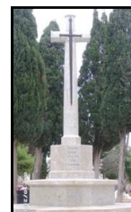
Photographs J. Dixon 2013