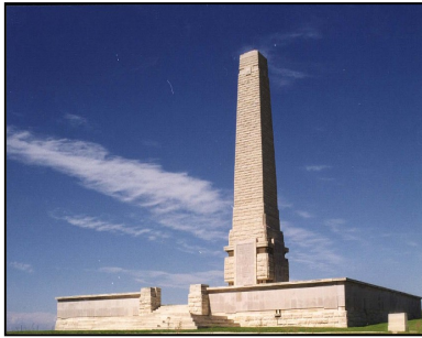
Helles Memorial. Turkey